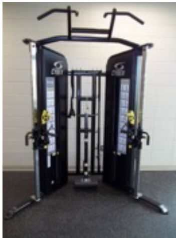
Bravo Pro Strength Machine

There are calendars on the school website as well with schedules of events for both the gymnasium and fitness room. Please check the calendars for any previously scheduled events. If there are any questions, concerns, suggestions, please contact the school by phone or email at gymfitness@schleswig.k12.ia.us .